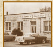
Future Historical Marker - Coming Soon!