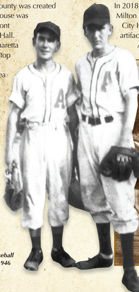
Alpharetta baseball players circa 1946

In 2018, Alpharetta opened the Alpharetta & Old Milton County History Museum inside Alpharetta's City Hall to establish a permanent collection of artifacts and interpretative displays that bring Alpharetta's heritage to life.