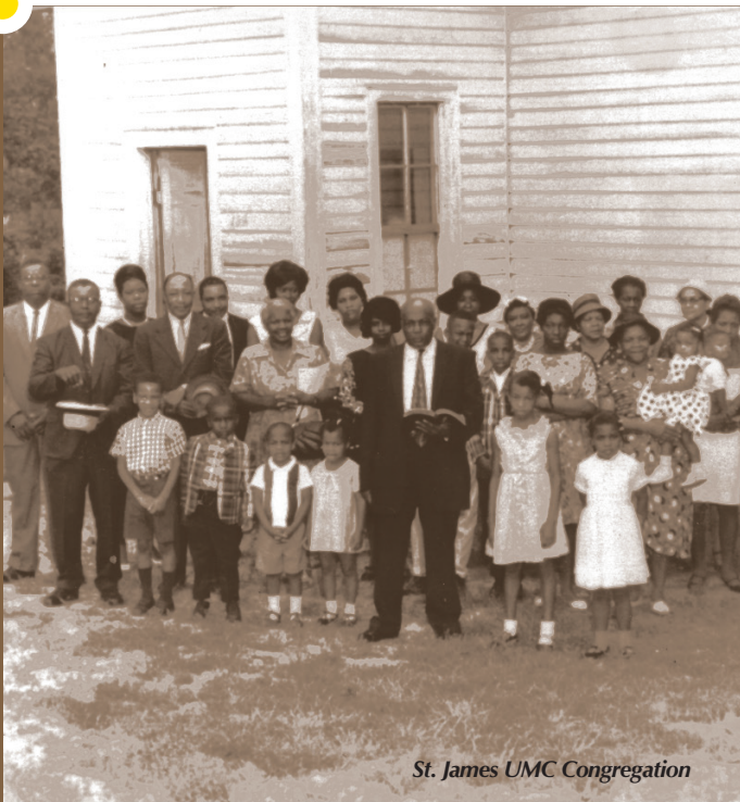
St. James UMC Congregation